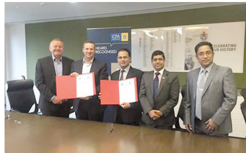
ICAN President signing the agreement with CPA Australia